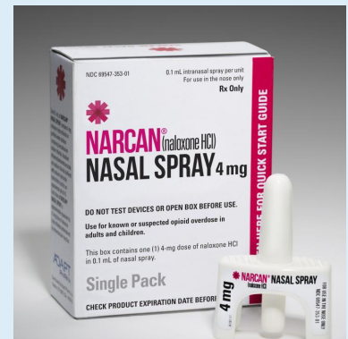
Naloxone (Narcan) Spray